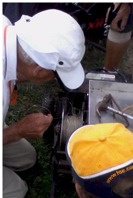
Another fast fun filled day gliding.

Wow look at that tangle! Took about ½ an hour to get clear.