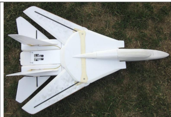
Is it one plane or two? Just one! Lee's first attempt at scratch building. A new swing wing FU14 Tomcat with twin fans just to make it more complicated.